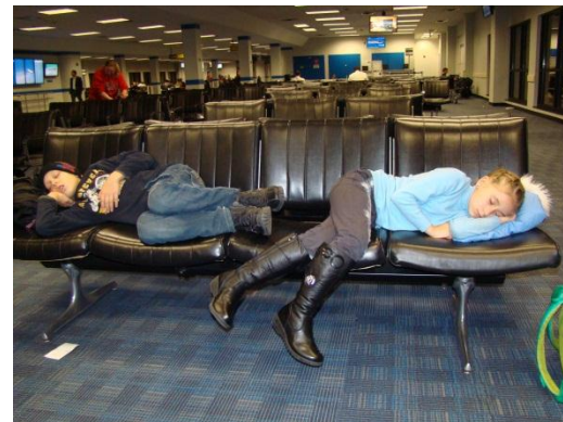
1 am...waiting for connecting flight

Here is a letter from one of the hosting families: