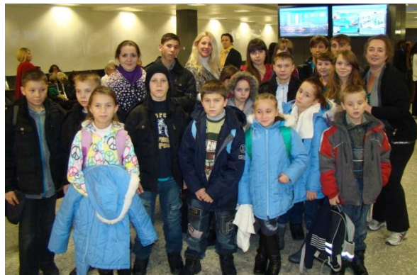
Our group at the airport